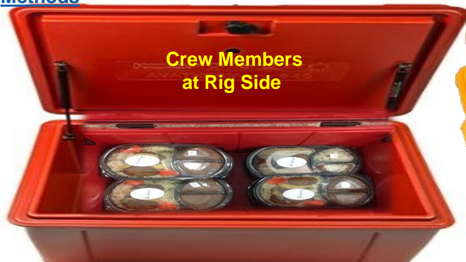
Crew Members at Rig Side